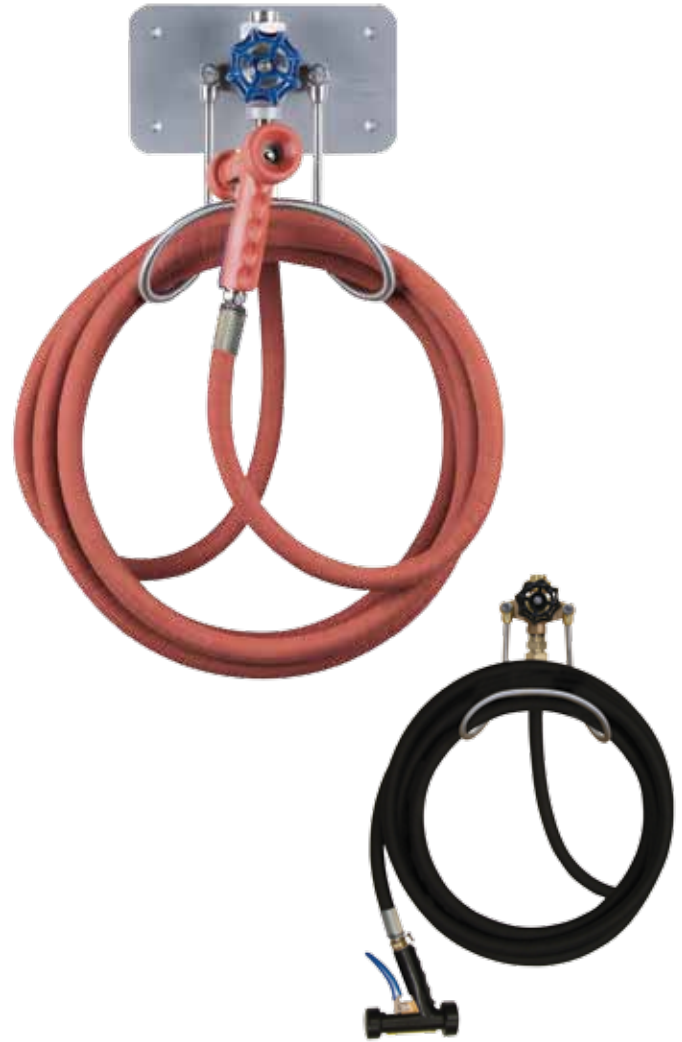
Shown above: M-756 with MP-88 mounting plate; shown with Strahman premium hose assembly and S-70 Series nozzle. Shown below: M-156N; shown with Strahman premium hose assembly and M-70 Series nozzle, available with MP-88 mounting plate.